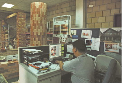
▲ Staff of the Marketing Department interact and maintain a close contact and seek solutions for customers

▼ Our products are produced under the most stringent quality control and they are ready to cater for various applications, such as:- building materials for new building, home improvement/renovation; interior & exterior designs; pavement & driveway; garden & landscape; & D.I.Y.