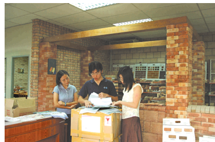
▲ Staff of the Marketing Department interact and maintain a close contact and seek solutions for customers

In addition, Claybricks also provides free, one-stop, professional consultation services in conceptualization and design for interior, exterior, fencing, landscaping, new/recondition building, and product applications and installation.